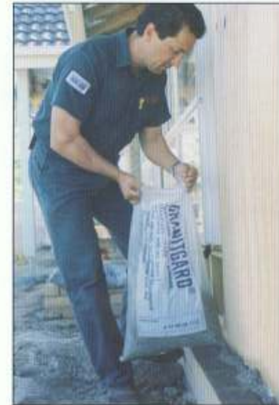
▲ PERIMETER INSTALLATION