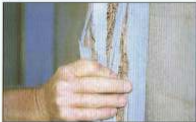
▲ TERMITE DAMAGE

Granitgard has been developed in conjunction with the Forestry and Forest Products Division of CSIRO. Extensive laboratory work and field trials throughout Australia have enabled the CSIRO to determine the precise specifications for the size, shape and composition of the stone barrier. Each batch of Granitgard is graded to these specifications to ensure impenetrability and tested for compliance in registered NATA laboratories.