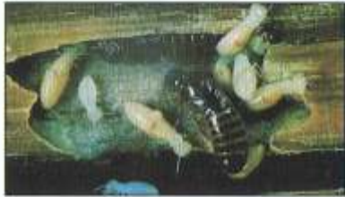
▲ TERMITES FEEDING

Subterranean termite (white ant) damage is a significant concern throughout mainland Australia. Each year the cost of repairing termite affected timber amounts to tens of millions of dollars. Infestation in some areas is greater than one in five houses. As a result, the Building Code of Australia makes it compulsory to provide a